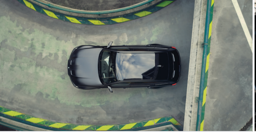
BMW M xDrive with Active M Differential offers high traction and driving dynamics for everyday driving, as well as at the racetrack. The exceptional BMW M xDrive system delivers AWD traction and performance with the RWD feel of a traditional sports car. The M specific technology combines the typical agility of a rear-wheel drive with the control of an all-wheel drive.