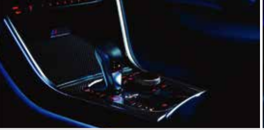
Time. Is relative: long phases sometimes seem like unimportant moments to us afterwards. Other moments are so big and rich and concise that they feel like eternity. The only difference is the feeling that carries you.