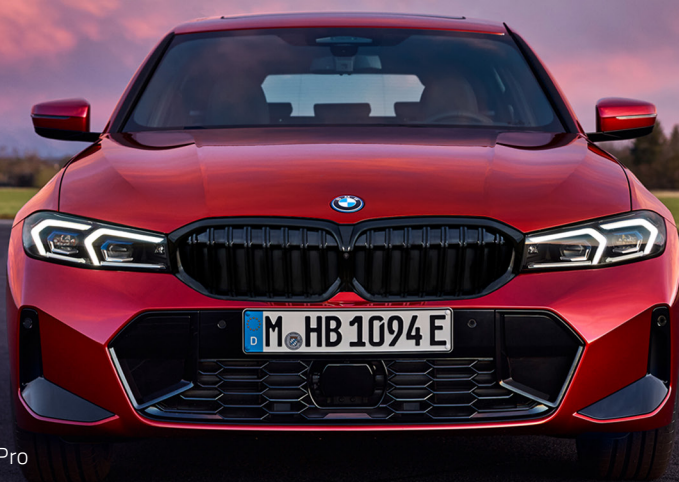
330i M Sport Pro