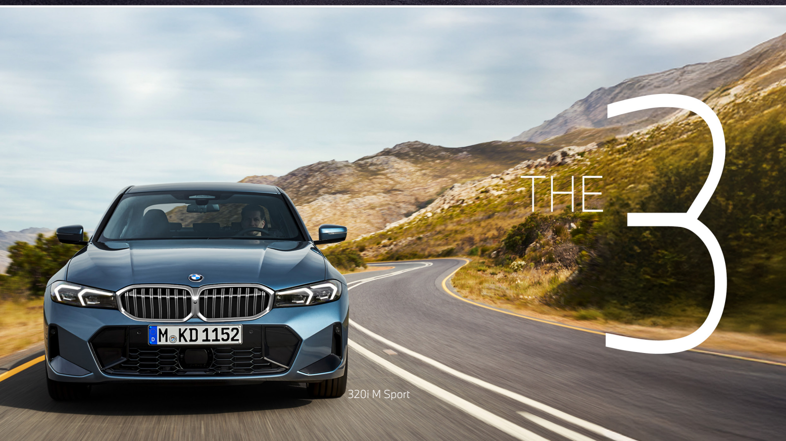
320i M Sport